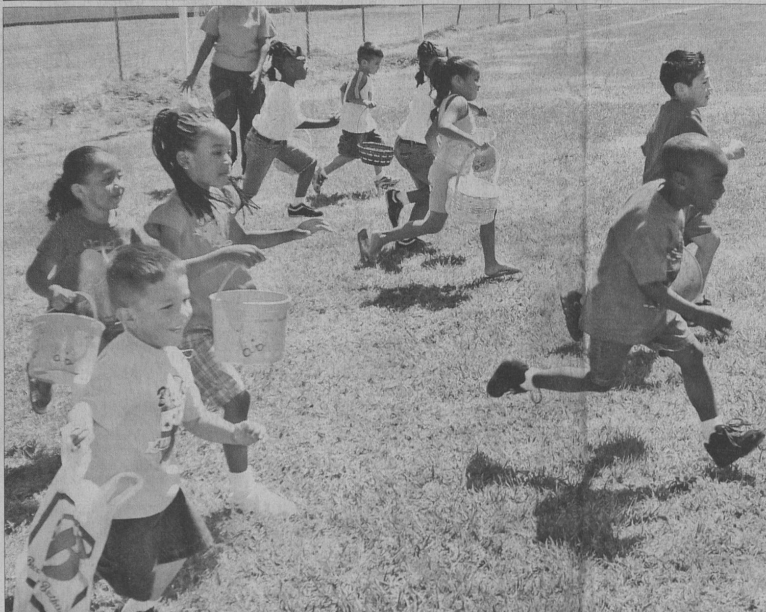
A group of kids make a dash for the loot during the Power Unlimited's Annual Easter Egg Hunt.